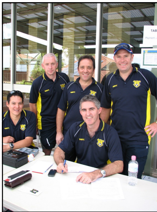
Some fathers at the St Bernadette's Football enrolment morning last year.

And it's the same with the church. That is why so many 'non-practising' Catholics still identify themselves as Catholics. They intuitively grasp